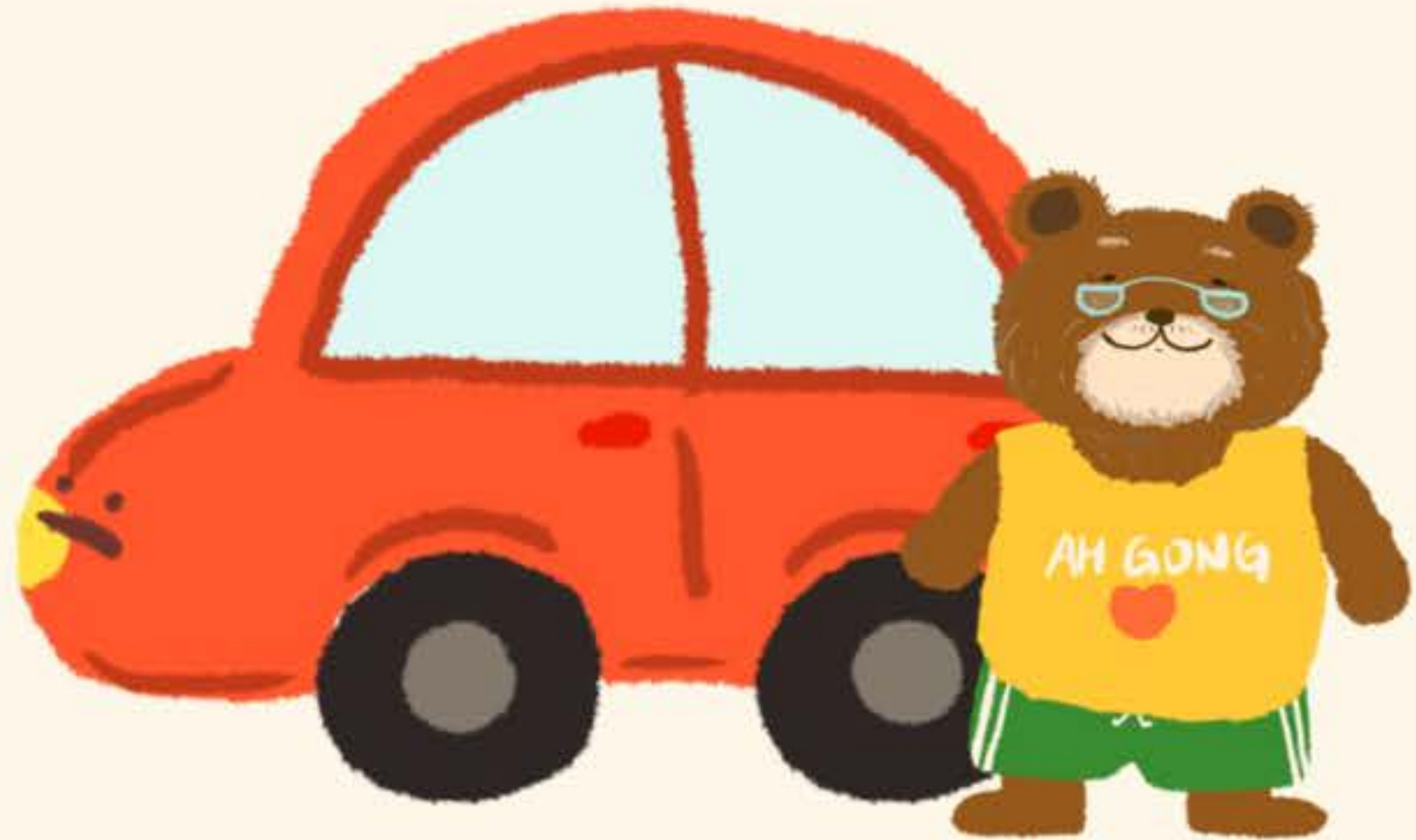
Grandpa Bear Storyline

To note: Kindness jar activity will be used in conjunction with Grandpa bear storyline