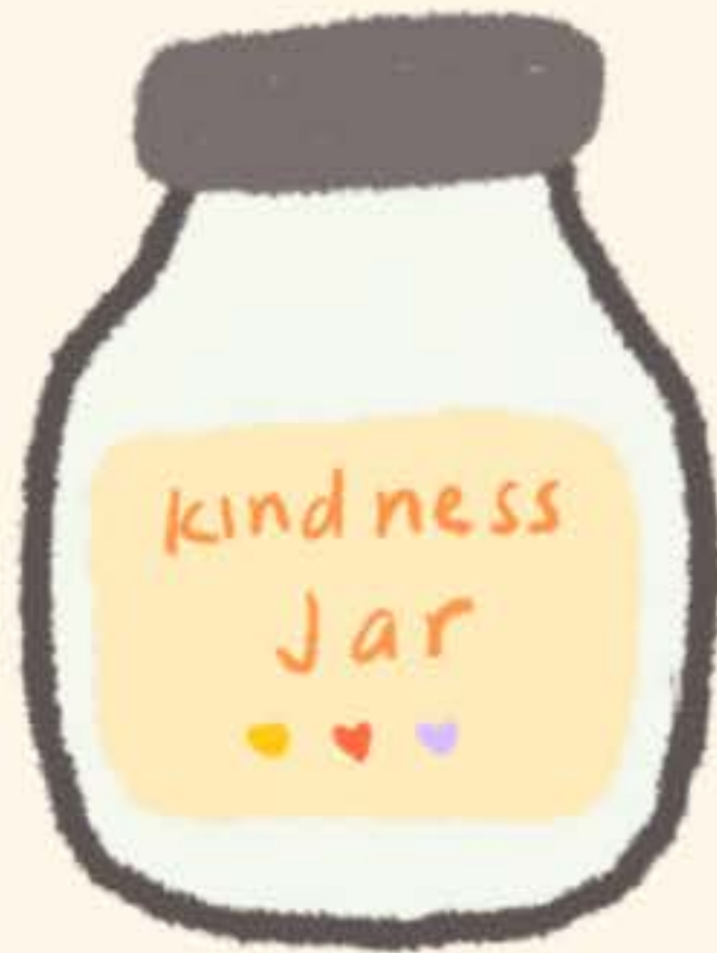
Kindness jar activity