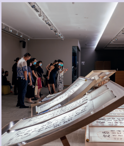
Creative Box, Level 6