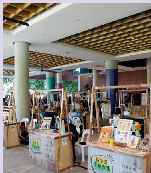
Concourse, Ground Level