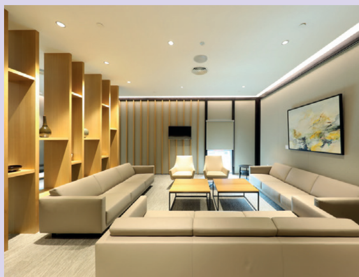
VIP Lounge, Level 9