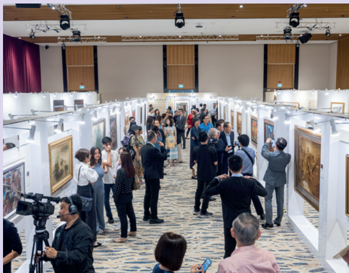
Multi-Purpose Hall, Level 7