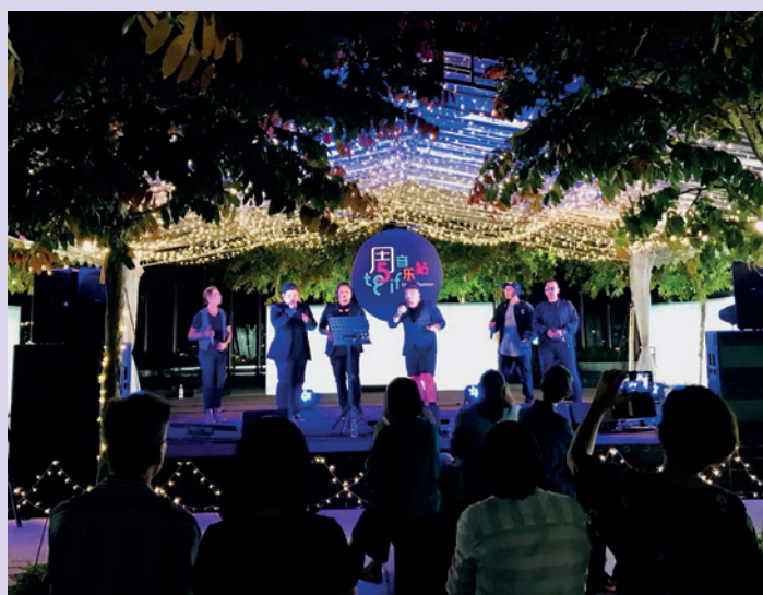
Roof Garden, Rooftop