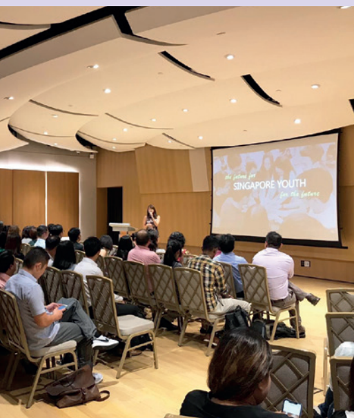
Recital Studio, Level 6