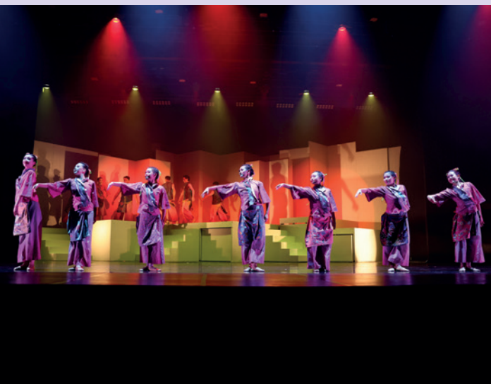
Auditorium, Level 9